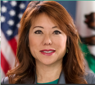
FIONA MA, CPA

Join us with our distinguished guest, California State Treasurer Fiona Ma, CPA for an elegant soiree of generous giving and great inspiration